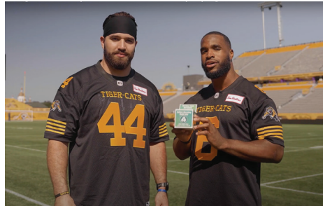
Players from four CFL teams encouraged consumers to recycle batteries.

In the third quarter, Call2Recycle partnered with four Canadian Football League (CFL) teams to convince consumers to recycle their batteries, leveraging the equity those teams hold within their communities. Players starred in amusing social media videos, amplifying Call2Recycle's environmental message. Football fans in British Columbia, Manitoba, Ontario, and Quebec were also encouraged to drop off their used batteries for their chance to win tickets and merchandise. Call2Recycle distributed 50,000 personal collection cubes during featured games, encouraging fans to adopt safe battery recycling habits at home.