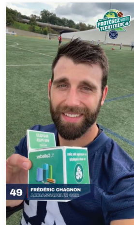
Call2Recycle partnered with the Montreal Alouettes CFL team to encourage Quebecers to recycle used batteries.

Call2Recycle's annual IPSOS poll of Quebec residents revealed that 81% are aware that batteries can be recycled, and an impressive 74% recycle some or all of their used batteries. However, 28% of those who threw away batteries did so because they did not know where to drop them off. Given the strong participation from Quebecers, Call2Recycle aims to enhance communication about the availability of its facilities to help residents responsibly and conveniently recycle their batteries.