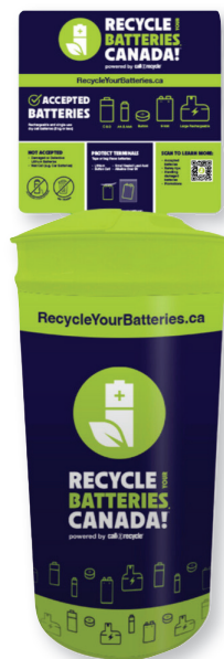
New Smart Container featuring the “Recycle Your Batteries, Canada!” consumer branding.

This new brand underscores Call2Recycle’s continued commitment to environmental stewardship. Recycle Your Batteries, Canada! will serve as the cornerstone for all consumer awareness efforts in 2024, fostering greater recycling engagement among Canadians. Call2Recycle believes that a more consumer-centric approach will not only make recycling more accessible but will also drive increased traffic to participating collection partners.