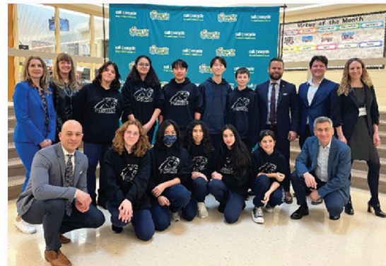
Battery Blitz school event with the Ontario Minister of the Environment in March 2023.