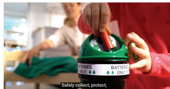
National TV commercials used the slogan “Collect, Protect, Drop Off” to educate consumers about safe battery recycling best practices.