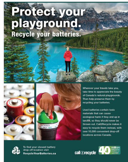
Call2Recycle's ad published in CAA magazine.

At the end of 2022, New Brunswick released its draft regulatory framework for a provincial battery recycling program. In 2023, Call2Recycle participated in subsequent consultations on the proposed framework, providing feedback and submitting comments to the New Brunswick Department of Environment and Climate Change. Amendments to the Designated Materials Regulation (Clean Environment Act) were issued in May 2024, and now include batteries. Call2Recycle will subsequently work with Recycle New Brunswick (RNB) to develop and submit a comprehensive program plan in 2024.