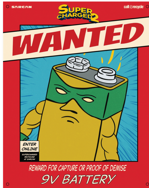
Call2Recycle partnered with SARCAN Recycling to launch the second Supercharged recycling contest in July 2023.