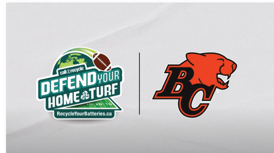
Call2Recycle partnered with the BC Lions CFL team to encourage British Columbians to recycle used batteries.

Looking ahead to 2024, Call2Recycle is excited to build on its success in British Columbia by leveraging its new consumer brand, Recycle Your Batteries, Canada! , and introducing its new Smart Containers equipped with advanced fire prevention technology and fill-level sensors. In collaboration with local municipal and retail partners, these initiatives will help increase the volumes of batteries diverted from landfills in the province.