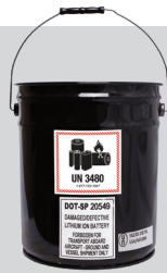
Metal Drum x1