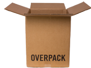
Overpack Box x1