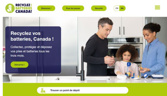
Original homepage for the Recycle Your Batteries, Canada! collection website.

Also supporting the brand is a new consumer website , which is designed to help educate consumers on the three steps to safely recycle batteries, using our slogan: Collect, Protect and Drop Off™ . The website is easily accessible thanks to its easy-to-remember URL, www.RecycleYourBatteries.ca .